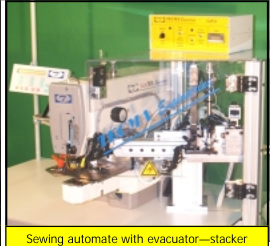
Sewing automate with evacuator—stacker