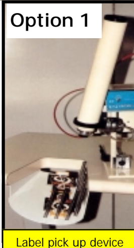
Label pick up device

Specific developments: please contact us